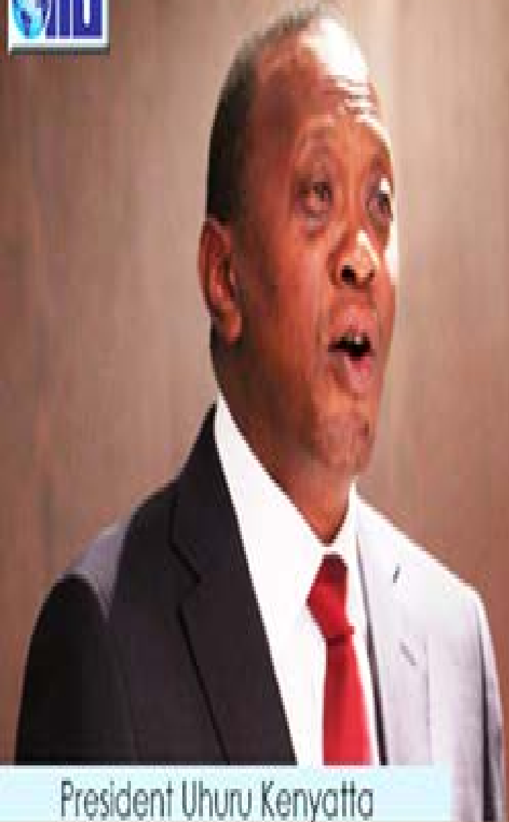
President Uhuru Kenyatta